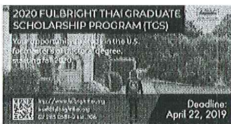
TGS 2020 Facebook Post.jpg 1009K