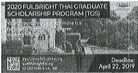
TGS 2020 Facebook Post.jpg 1009K